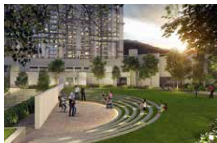
AMPHITHEATRE FOR 250 PEOPLE