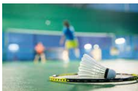
MULTI-PURPOSE HALL & BADMINTON COURT