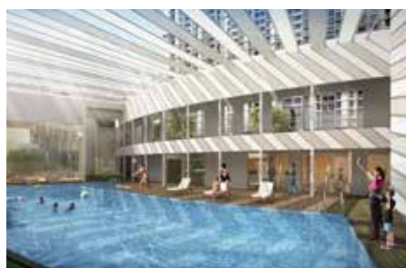
SEMI-COVERED SWIMMING POOL