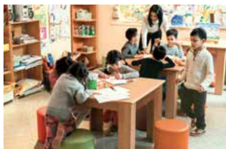
TODDLERS' PLAY AREA