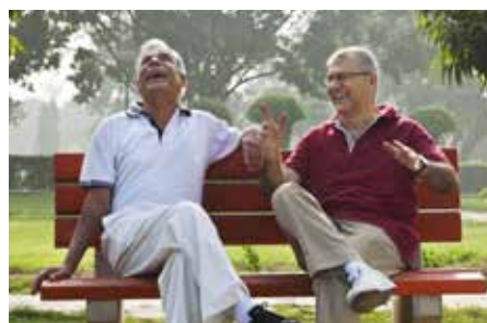
SENIOR CITIZENS' ALCOVE (FOR EVERY WING)