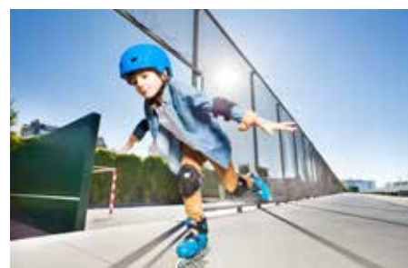
KIDS' PLAY AREA (FOR EVERY WING)